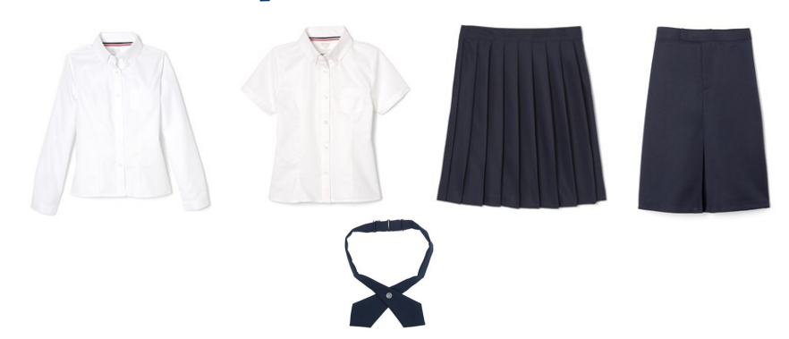
Girls - Daily Uniform Attire